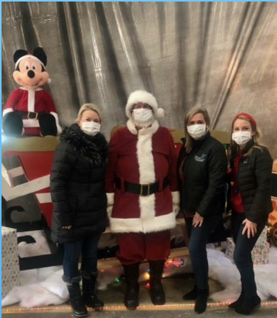
FEAT Team and Santa